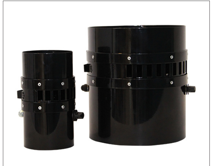
Smart Cool SC